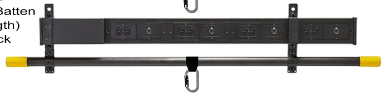
Optional Anchor Straps And Carabiners Available In Place Of Beam Clamps For 1 Beam, Bar Joist, Wood Beam Or Batten 2 GEAR Anchor Straps (Custom Length) 2 Petzl Carabiners M33ABL Ball Lock