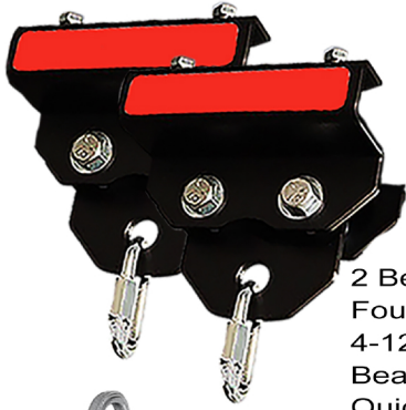
2 Beam Clamps Four Sizes To Fit 4-12" (10-30 cm) Beam Flange Quick Links Included

Equipment list is a recommended suggestion for general operation and not intended to accommodate all venue configurations. Some equipment options may be necessary to accommodate a particular venue's spacial dimensions, available anchoring, structural supports or other specifications unique to that venue.