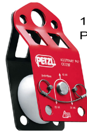
1 Knot Passing Pulley Petzl P67