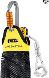
1 Pre-Rigged 4:1 Hoisting Rig Petzl JAG 5 m Carabiners Included