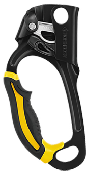
1 Locking Rope Grab Ascender Petzl B17ALA Left Hand Black (Optional B17ARA Right Hand Yellow)